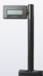
90ACC0340 Single Display/Single Interval