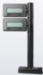
90ACC0343 Dual Display/Single Interval